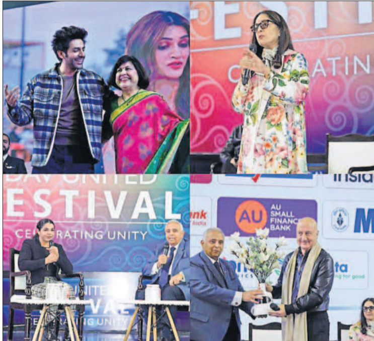
The festival manifests the underlying objective of DAV United - a celebration of the spirit of unity among more than 20 million DAVians

THE EVENT IS GOING TO WITNESS THE PARTICIPATION OF ALL DAV SCHOOLS FROM WESTERN REGION WHICH IS GOING TO SHOWCASE THE EVOLUTION OF DAV