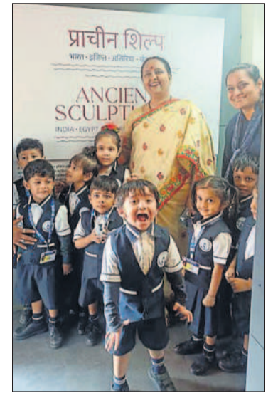
St Wilfred's School had arranged mobile museum in school premises.

the new Era of the cultural inclusivity by keeping in mind the interests of its future generation. Each and every child including the teachers enjoyed this fruitful event. In conclusion, the concept of mobile museums is not just a novel educational approach; it's a transformative voyage into the heart of experiential learning. As these wheels of wisdom traverse the educational landscape, they leave an indelible mark, proving that the pursuit of knowledge knows no bounds and can roll into the most unexpected corners of our world.