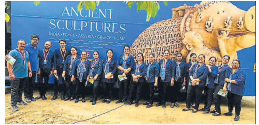
'Museum on the wheels' is the venture by the Chhatrapati Shivaji Maharaj Vastu Sangrahalaya [CSMVS] formerly known as The Prince of Wales Museum.

STUDENTS WERE TREATED TO A HOLISTIC LEARNING EXPERIENCE AS THEY GOT TO DO HANDS ON WORK WITH INTERACTIVE KITS