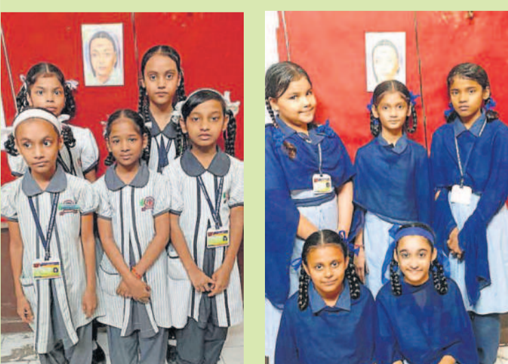
New Era English High school celebrated the 193rd birth anniversary of social reformer Savitri Bai Phule.